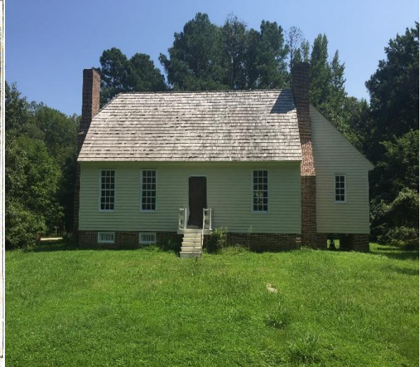
Western Montana, Montana

The Foundation's purpose is for Education and Preservation honoring the life and legacy of James Monroe, our fifth President and founding father. He was the only U.S. President to have served in active military duty in the Revolutionary War other than George Washington, and helped save this nation during the War of 1812 when he served as both Secretary of State and Secretary of War. Visit the Museum with its exhibits honoring President James Monroe, and see the reconstructed Birthplace house.