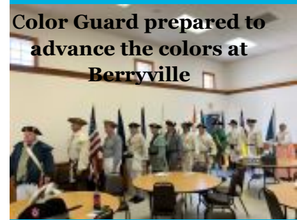
Color Guard prepared to advance the colors at Berryville