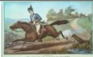
THE ESCAPE OF JOHN CHAMPE