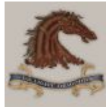
Guidon of the U.S. Light Dragoons