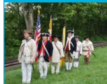
Color Guard prepared to advance the colors

The Maryland Society SAR sponsored a commemoration of General Anthony Wayne's army crossing of the Potomac on May 31, 1781. General Washington Ordered Wayne's army of 1100 Maryland Continental troops, supplies and artillery to leave garrison at York, PA and march south to join General Lafayette's Army. After crossing into Virginia the Army proceeded to march south, joining Lafayette on June 10, 1781. Faced with the combined armies, General Cornwallis moved his army to Yorktown where the American Army boxed him in. When the French Navy defeated the British Navy in the Battle of the Capes all possibility of escape was closed. The British Army surrendered October 19, 1781.