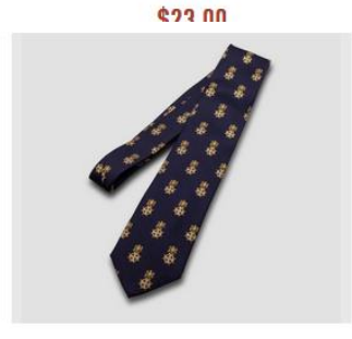
NAVY SAR LOGO TIE