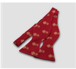
SAR RED BOW TIE