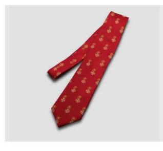
SAR RED LOGO TIE $35.00