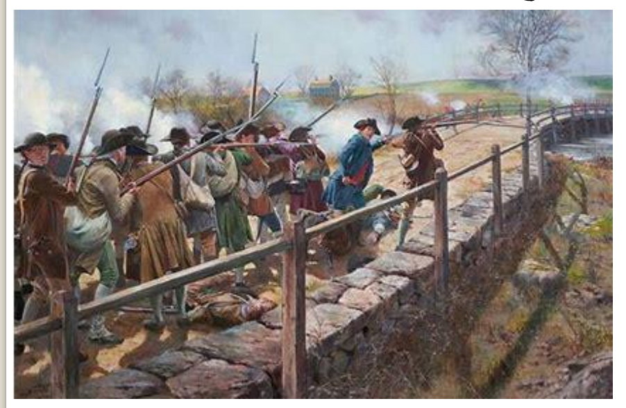
Great Bridge Battlefield & Waterways Park 1775 Historic Way, Chesapeake, VA 23320