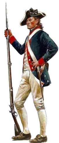
John Trumbull - US Capitol

The month when we celebrate our nation's birthday is a good time to think about Independence and what it truly means.