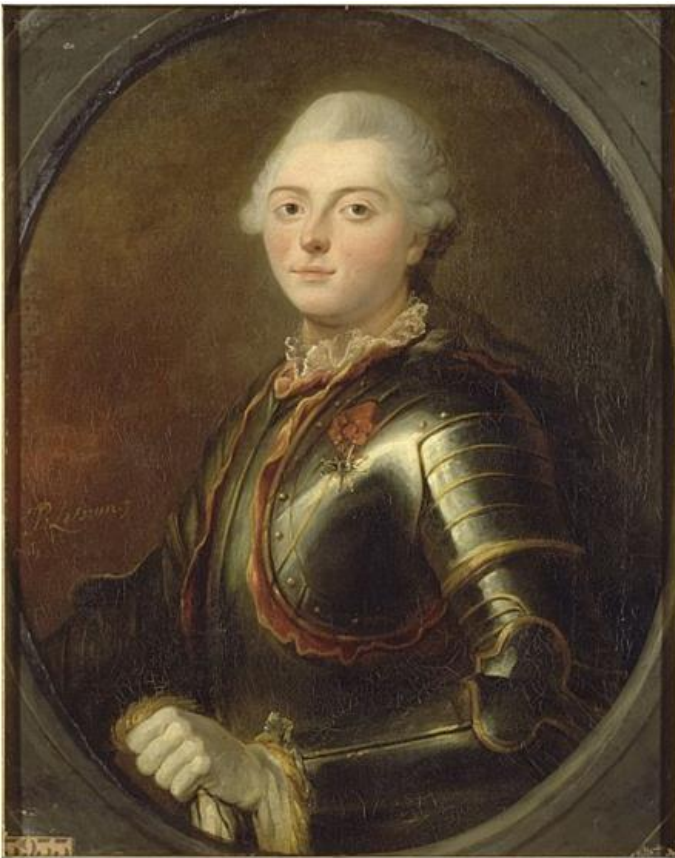
Count d'Estaing in 1769. D'Estaing commanded the French squadron sent in 1778-1779 to support the American Revolution.

This tale began with the Revolutionary War battle for Savannah, Georgia, on the morning of Oct. 9, 1779. Two columns of American and three columns of French soldiers stormed the British entrenchments, only to suffer one of the bloodiest defeats of the war. The French commander, Adm. Jean-Baptiste-Charles-Henri-Théodat-Hector, the Comte d'Estaing du Saillans, was wounded three times. Left for dead, he was rescued from the battlefield and survived.