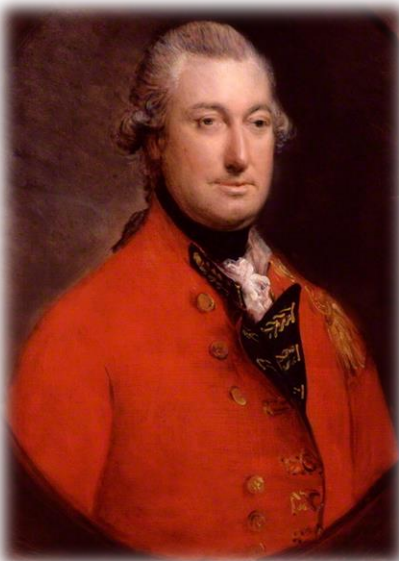
Earl Charles Cornwallis

On July 6, 1781 United States Brigadier General "Mad" Anthony Wayne, leading the advance forces of the Marquis de Lafayette, was ambushed near the Green Spring plantation by the British army of Earl Charles Cornwallis in the last major land battle of the Virginia campaign prior to the Siege of Yorktown.