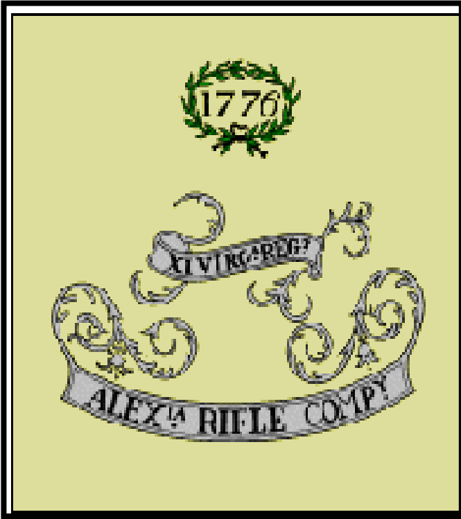
Colors of the Eleventh Virginia Regiment 1777

In 1777 Colonel Daniel Morgan was assigned to raise and command a new regiment, the 11th Virginia Regiment of the Continental Line. His recruiting test for riflemen became campfire legend. He printed a picture of the head of a British officer (some said King George himself) and only recruited those who could hit this target with their first shot at one hundred yards. When word of this reached England Morgan was regarded as a war criminal.