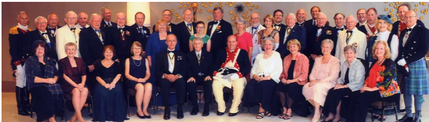
Group photo of the VASSAR attendees.

All in all the Congress was a great experience for all of our folks from VASSAR.