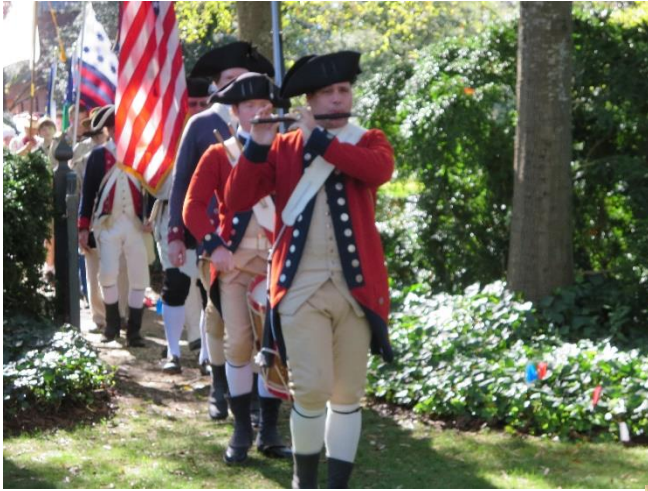
The Colonial Williamsburg Fife and Drum Corps lead the procession into the ceremony