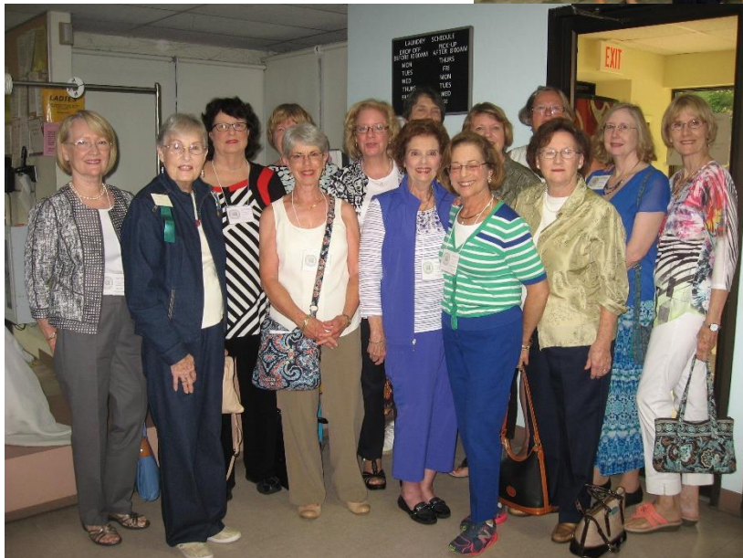
Left: The wives of the SAR attendees were treated to a special tour of the Colonial Williamsburg Costume Design Center.