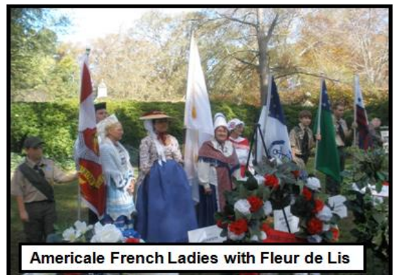
Americale French Ladies with Fleur de Lis