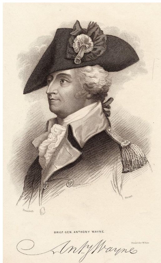
General "Mad" Antony Wayne

Please join the Williamsburg Chapter SAR on July 6th for a commemoration and wreath laying ceremony at the Church on the Main site near Jamestown, VA. The ceremony will start at 10:00am.