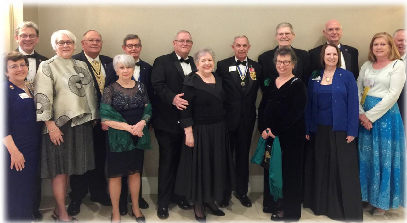
Our chapter well represented at the 123rd Virginia DAR Conference in Richmond