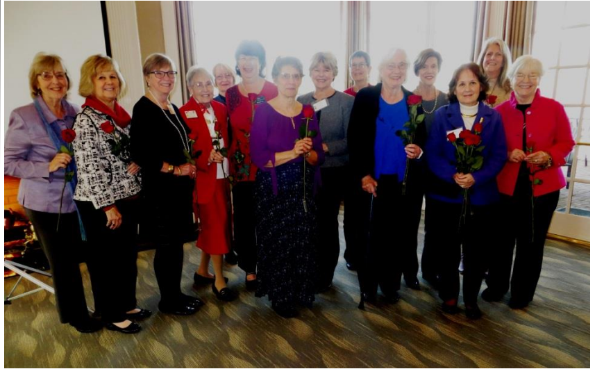
14 of the 21 “Valentines” at our February meeting