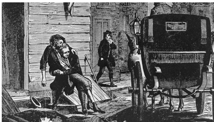
18 th century woodcut

*Information for this article was drawn in part from an article, “What the Doctor ordered: Dr. Benjamin Rush Responds to Yellow Fever” in an article published by The Historical Society of Pennsylvania. Link: https://hsp.org/education/unit-plans/diagnosing-and-treating-yellow-fever-in-philadelphia-1793/what-the-doctor-ordered-dr-benjamin-rush-responds-to-yellow-fever