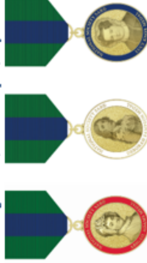
L to R: Abigail Adams, Deborah Sampson, Lucy Knox.