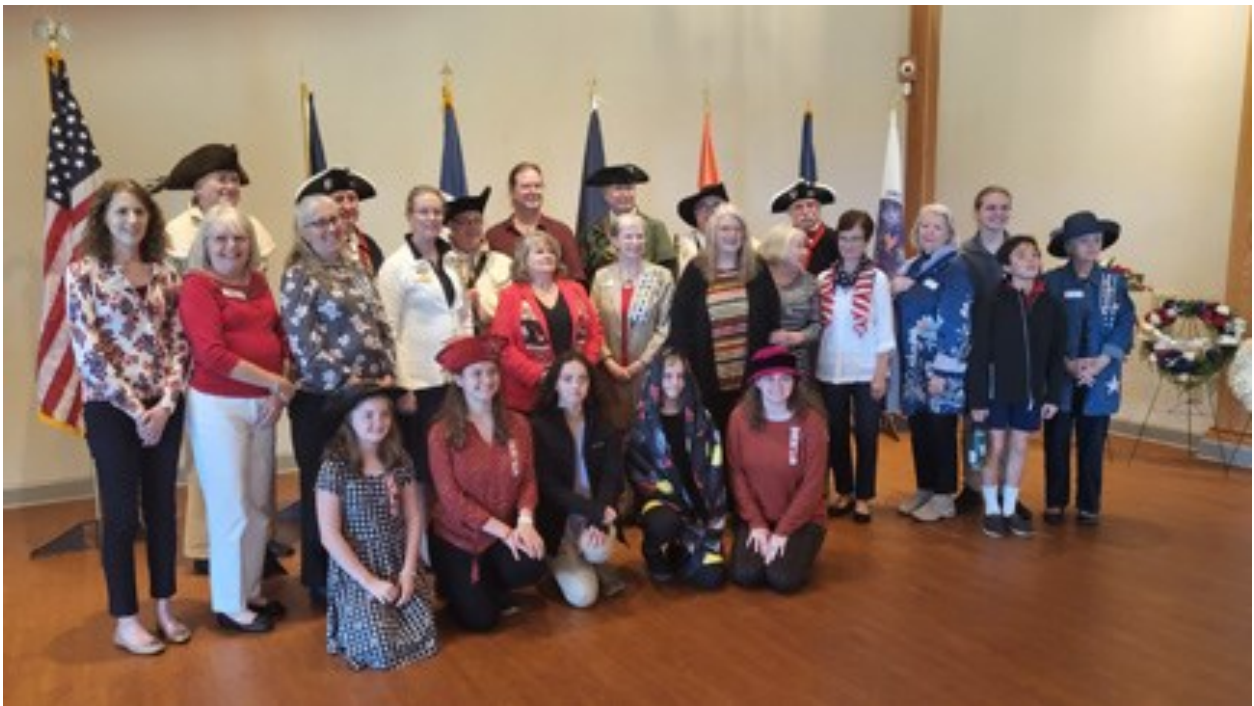
Memorial Weekend 2023, where Daughters from across the state of Virginia joined the Patrick Henry Chapter VASSAR in commemorating the 287th Anniversary of Patrick Henry's Birthday.