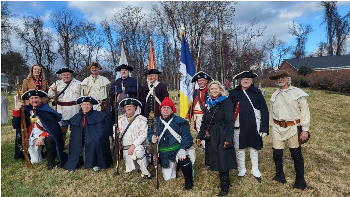
Ketocin Chapter DAR sponsored 2022 Wreath's Across America. Color Guard support provided by multiple chapters from the Virginia SAR.

Most recently the DAR has established The Hannah White Arnett Medal, for Distinguished Service to NSDAR, to recognize the many compatriots from the SAR and S.R. who serve alongside the DAR in Sparkling Service to America. There are three levels of recognition: chapter level (bronze), state level (silver), and national level (gold).