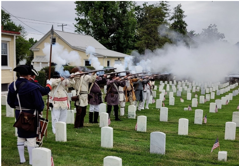
VASSAR Color Guard Musket Volley.