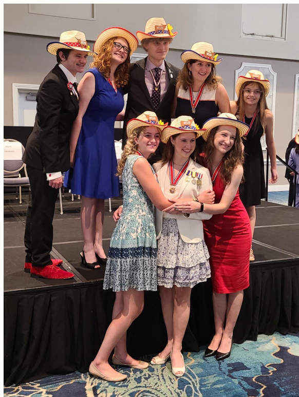
The C.A.R. attendees sporting their "Cracker Cattle" straw hats at the luncheon

All the participants and award recipients received a standing ovation and round of applause for their achievements and participation in the SAR Youth Programs. I look forward to attending again next year.