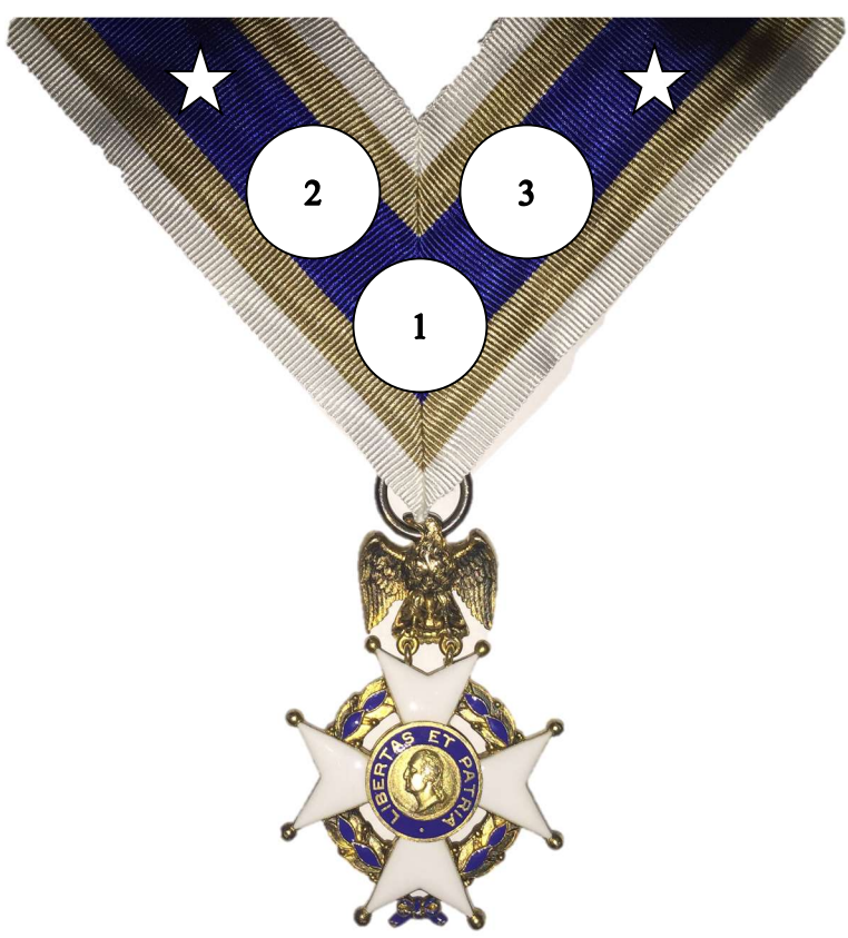
Figure 1. Placement of pins on SAR Neck Ribbon when facing wearer.