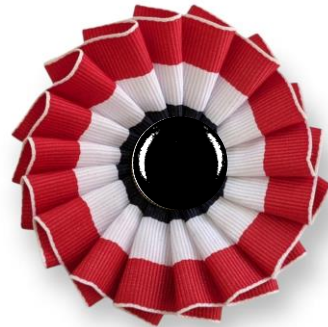
Black Powder Musketman