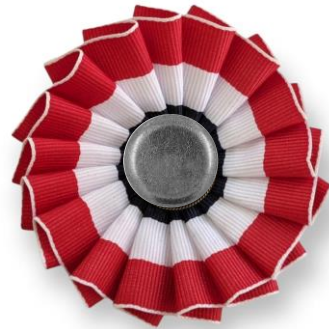
Musket Safety Observer