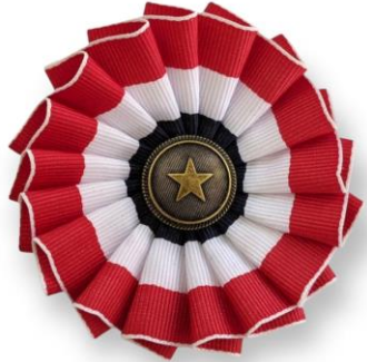
Musket Squad Commander